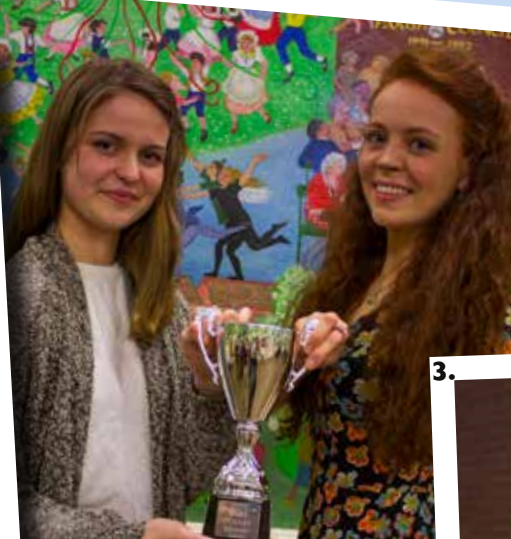
Taplow Youth Choir members enjoy very busy lives outside of their fortnightly rehearsals, as shown by these pictures.