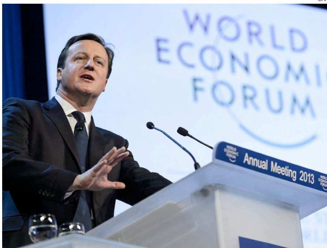
David Cameron addressing the World Economic Forum in January.

They said that in agreeing with David Cameron's argument that "companies should pay their fair tax" indicated an end to the speculations over the threat of investment.