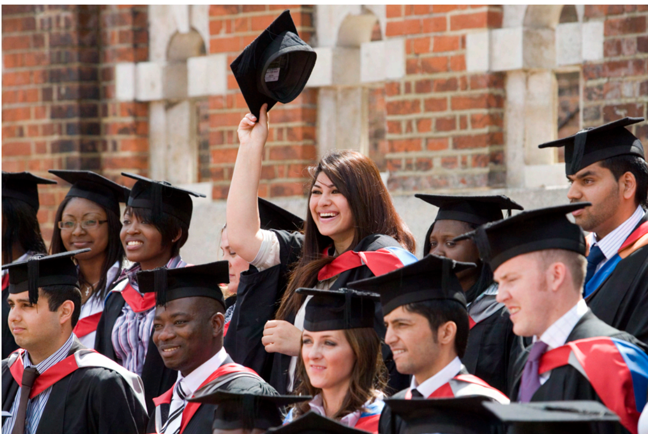
The University of Kent

Young people who would benefit more from vocational courses and apprenticeships are, to an extent, being