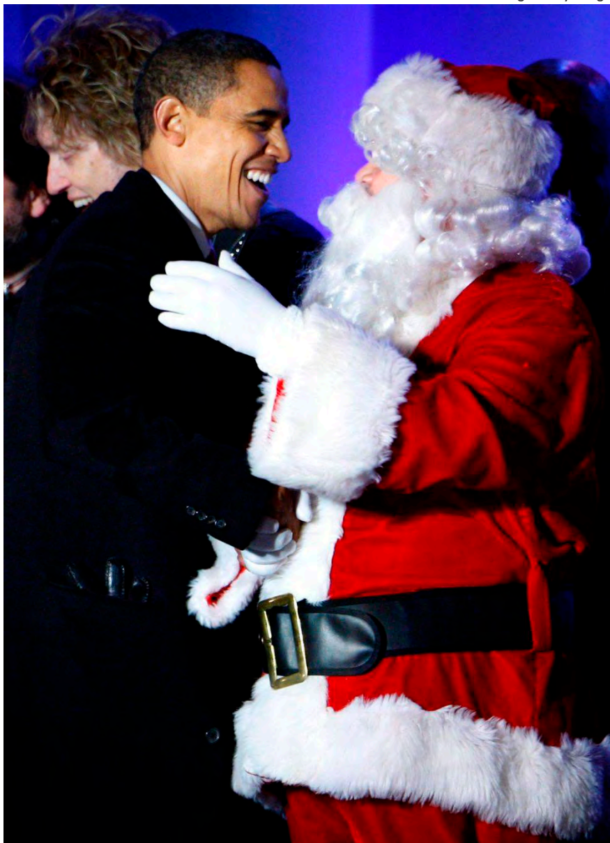
President Obama greets Father Christmas at a festive event in 2009. But this Christmas looks set to be far less merry, if the economic situation is not fixed.