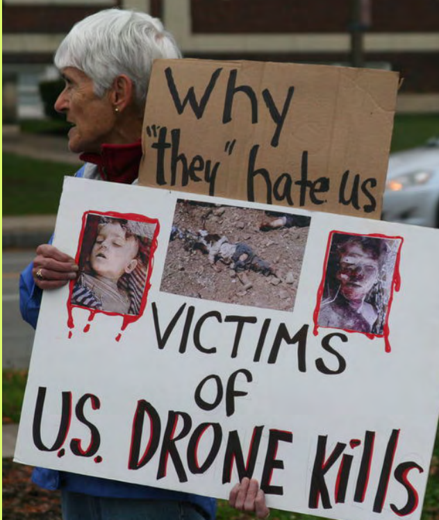
An American woman protests against drone warfare in Brighton, Rochester.

administration and, along with them, so too have the number of civilians killed. A recent report carried out jointly by Stanford University Law School and New York University identified this problem, highlighting serious concerns on the impact on innocent civilians by the drone warfare waged by the Obama administration, citing that civilian casualties do fuel militancy and anti-American sentiment, detrimental to the larger and long-term aims of the US in the region.