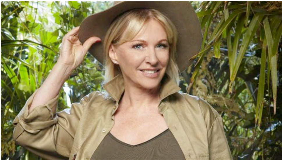
Nadine Dorries was criticised for abandoning her constituency while appearing on the ITV programme.

Conservative MP Nadine Dorries caused consternation in early-November when confirming rumours that she would be taking time off parliament to appear in ITV's popular show I'm a Celebrity... Get Me Out of Here! A supposedly "furious" David Cameron suspended her from her position, however he has declined to comment on her jungle antics. Unless she is reinstated, Ms Dorries will have to sit as an independent in the House of Commons and cannot stand as a Conservative MP at the next election.