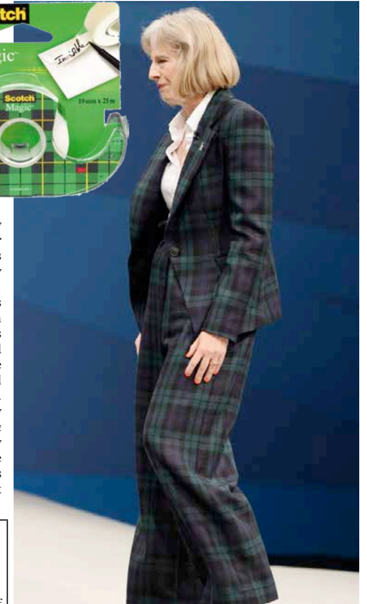
STEPPING OUT: Theresa May, the Home Secretary, wore a Vivienne Westwood suit as she made her speech at the Tory Party Conference. Yet unlike the adhesive tape its pattern is reminiscent of, the Maidenhead MP's speech failed to stick.